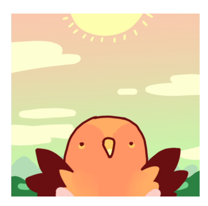
Created By Cecelia Bichette

They are collaborating directly with tribes and local communities to make sure their endeavors are most effective. The Department of Land and Natural Resources is another crucial organization to shout out. Using non-compatible mosquitoes on a landscape-scale basis, they plan on developing effective mosquito management for the Hawaiian Islands. They are also in the process of developing more captive propagation facilities at the San Diego Zoo Wildlife Alliance's Maui Bird Conservation Center. This will provide the birds with a safe space to breed in captivity. The U.S. Fish and Wildlife Service has gifted the DLNR $6.5 million to fund their projects.