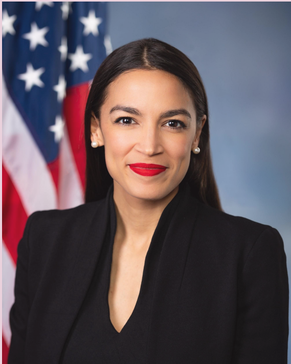
Official portrait, 2019

Alexandria Ocasio-Cortez is an American political figure who is a role model for many activists today. She grew up in the Bronx in a Puerto Rican family. The financial crisis of 2008 led her to work as a waitress. Her younger brother nominated her for Brand New Congress, a group trying to find progressives that could challenge the stereotype that comes to mind when someone is thinking of a politician.